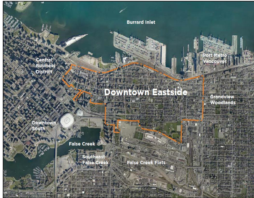
Figure 2. Aerial Imaging of Downtown Eastside 151